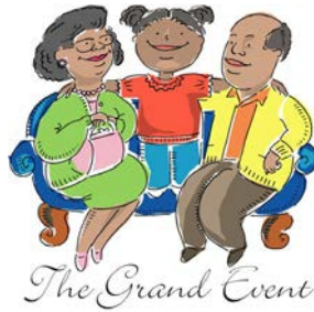
The Grand Event

This Sunday, November 14, 2:00-3:30 pm Religious Formation students will be hosting a celebration honoring their grandparents and grand-friends at Christ the Servant Church.