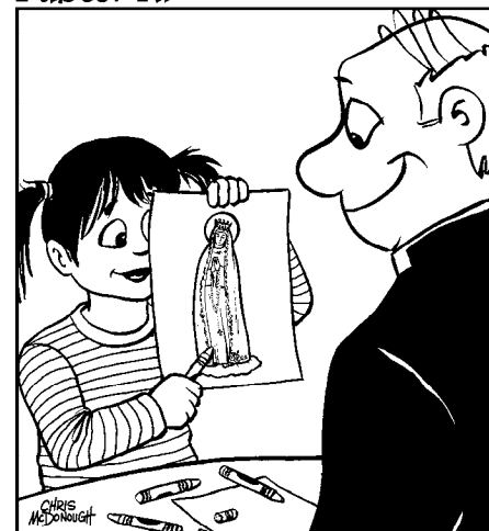
"How come I only colored our Blessed Mother using shades of greys? You know... 'Hail Mary, full of greys!'"