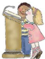
Religious Formation Family Mass