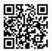
SCAN QR CODE