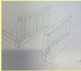
Drawing not to scale.